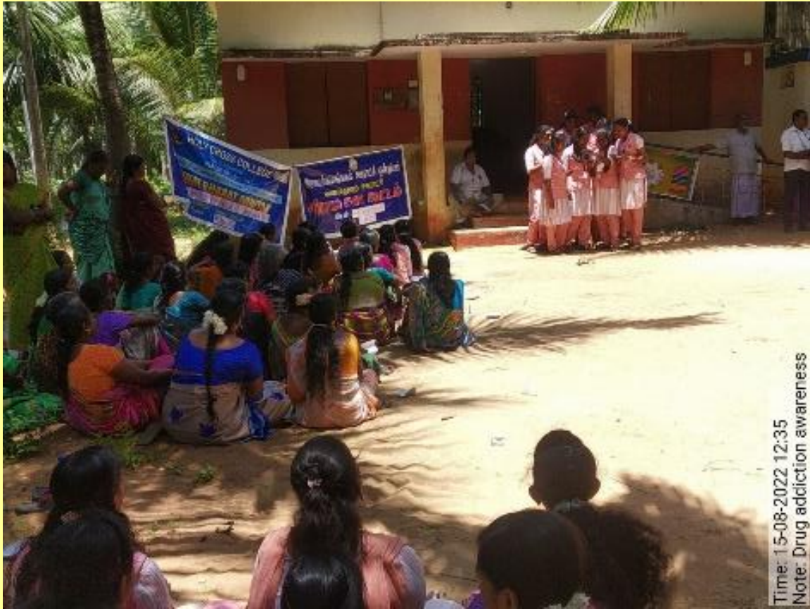
Time: 15-08-2022 12:35 Note: Drug addiction awareness

4. Title of the Programme : Talk on “Entrepreneurship” and “Health & Hygiene.” Date : 24.09.2022 Organized by : English (Aided and SF), Holy Cross College (Autonomous), Nagercoil Theme / Objective : To know about the importance of Rural Entrepreneurship Resource Person : - Outcome of the Activity : The students understood the importance of Rural Entrepreneurship No. of Beneficiaries : 160 Venue : Manakkudy